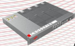
A2 Access Unit