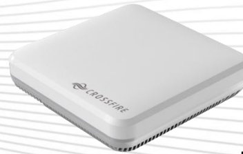
N2RU Nano Power Remote Unit