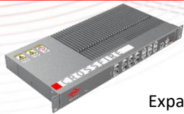
EU-O Optical Expansion Unit